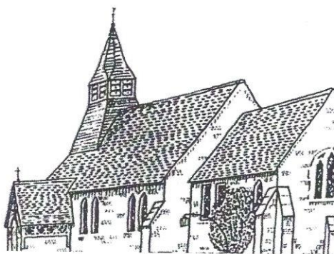
St Peter ad Vincula, Tibberton